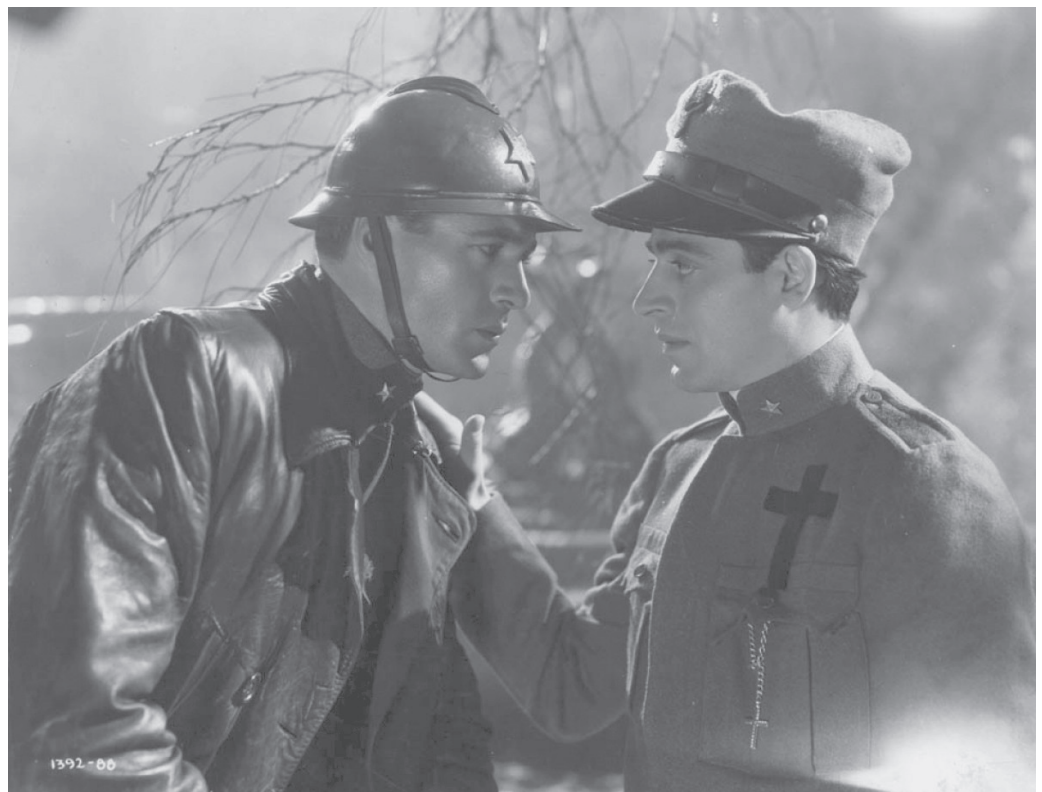
A Farewell to Arms, 1932

This series will publish original manuscripts addressing the representation of war and/or the military in popular movies, television shows, or video games. Books will be brief and written in a critical but accessible style, suitable for popular consumption or classroom use. Submissions may examine an important depiction of war or the military in a single film, television program, or video game, or they may analyze themes and trends across texts or media (e.g., the military musical; the staging of “combat” across media platforms; recruiting via screen media; World War I on film; war trauma and videogames). All submissions should combine analysis of specific media texts with contextual analyses of production and reception history.