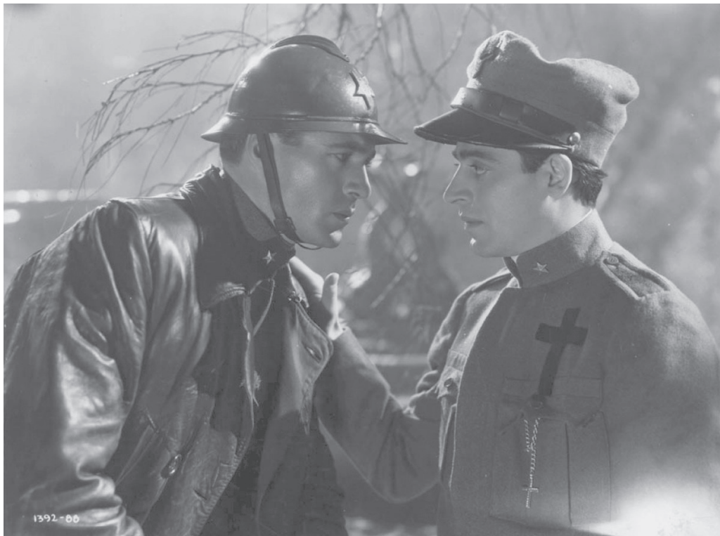
A Farewell to Arms, 1932

This series will publish original manuscripts addressing the representation of war and/or the military in popular movies, television shows, or video games. Books will be brief and written in a critical but accessible style, suitable for popular consumption or classroom use. Submissions may examine an important depiction of war or the military in a single film, television program, or video game, or they may analyze themes and trends across texts or media (e.g., the military musical; the staging of “combat” across media platforms; recruiting via screen media; World War I on film; war trauma and videogames). All submissions should combine analysis of specific media texts with contextual analyses of production and reception history.